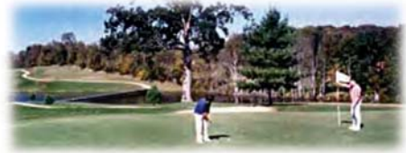
Canewood Golf Course