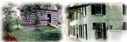
Royal Springs Park (left), downtown (right)