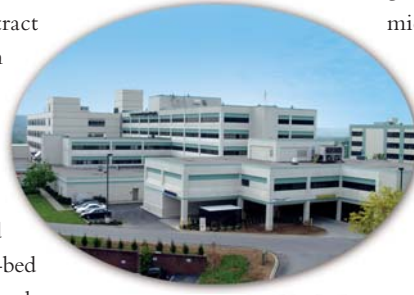
LAKE CUMBERLAND Regional Hospital

Lake Cumberland Regional Hospital, a 259-bed facility, provides primary and secondary medical services to an 11-county area. The hospital, a recent winner of the prestigious and nationally renowned 100 Top Hospitals award, is one of only three hospitals in the United States that serves both as a rural regional referral center and a disproportionate-share facility. Lake Cumberland Regional Hospital recently launched a $55 million construction project, which includes a new patient tower (25 additional beds) and a three-level parking garage.