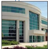
Center for Rural Development

Facilities include a state-of-the-art Intensive Care Unit, comprehensive Clinical Pathology, a Radiology Department with Nuclear Medicine, Ultrasound, whole-body spiral CT Scanning and two 1.5 Tesla fixed-site MRIs. Other services include the Heart and Lung Institute, where thoracic and cardiac surgery are offered, Rehab, Neuro Sciences Institute, and two Cath Labs. The facility, a regional cancer treatment center, has a Linear Accelerator and IMRT. The 24-hour ER is among the busiest in the state. Specialties include Gastroenterology, OB Neurosurgery, Orthopedic, General Surgery, Gynecology, Ophthalmology, Cardiology, ENT, Open Heart, Urology, Pulmonary Medicine, and Pediatrics.