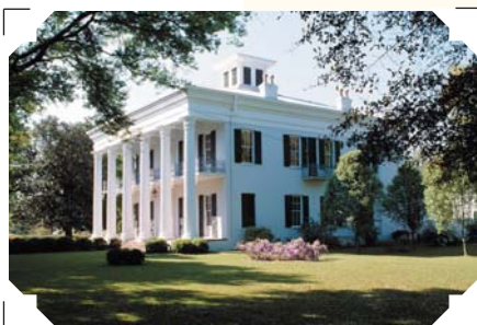
(above) Antebellum homes are part of the rich Southern tradition that abounds in Selma. (below left) A view of the historic bridge that crosses the Alabama River.

Downtown Selma is a delight. Century-old buildings that once warehoused cotton and Civil War munitions are now home to wonderful specialty shops, cafes and offices. Selma offers a host of cultural opportunities for both artist and the arts lover, thanks to the work of the Selma-Dallas County Arts Council. The Selma Art Guild Gallery , housed in a quaint turn-of-the-century cottage in the Olde Town District, exhibits paintings, intricate wooden arts, pottery, and other items by area artists.