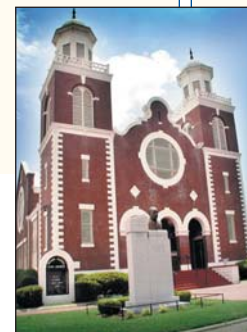
Historic Brown AME Church (est. 1909)

The city of Selma operates two public golf courses, and is within two hours of five Robert Trent Jones golf courses. Selma also sports five lighted baseball diamonds, eight lighted softball diamonds, a new softball/baseball complex, 20 hard surfaced tennis courts, and organized leagues in baseball, football, soccer, softball, and ladies' and men's tennis.